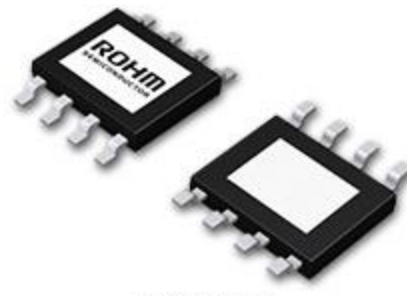
HTSOP-J8 (4.9mm x 6mm x 1mm)

ROHM developed the BD9x family of buck DC/DC converters to meet the various requirements of DC/DC converter applications. From the matrix of input voltage and output current, users can easily find the ideal power supply solution to fit set needs. The optimum product can also be selected based on high-speed response control, light load mode, and other characteristics.